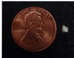
2 milligrams of powder next to a penny.

On Wednesday, March 29th, the department was notified by the Hennepin County Medical Examiner’s Office of toxicology results stemming from a death investigation. The results indicated the cause of death of a 43-year-old woman was due to Carfentanil, a highly-potent synthetic opioid. The same day, the medical examiner received toxicology results from four other overdose deaths, which